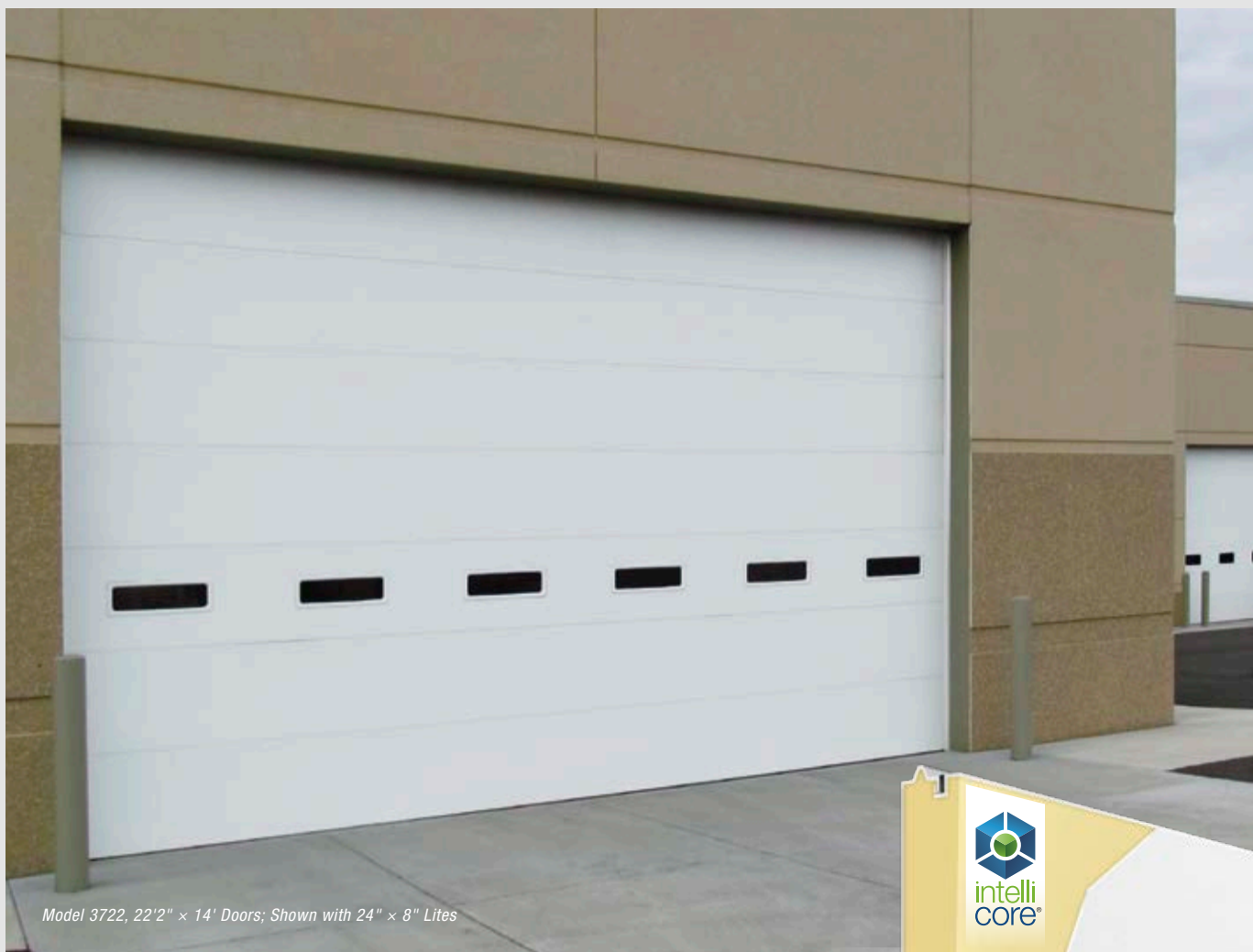
Model 3722, 22'2" x 14' Doors; Shown with 24" x 8" Lites